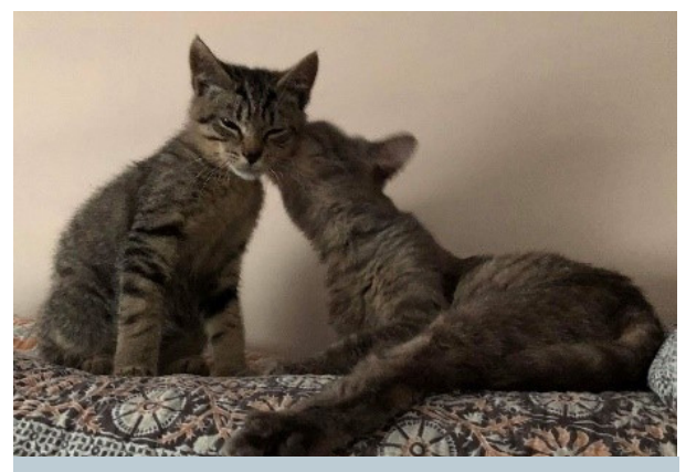
Looking - and feeling! - much better.

A week later this individual was still determined to place as many of these animals as she could into shelters willing to help. You see, she was trying to fulfill a dying man's wish for these cats, and not to leave the burden of the large number to care for on his partner. She reached out a little further and found a Humane Society willing to take 22 of them in! She spent her morning rounding them up and loaded them in her vehicle and drove nearly two hours to a place she thought was going to help. Once she arrived, after a short exam she was told some had lice. Because all had been exposed they would be con't. on page 2